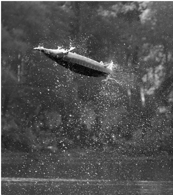
Catching Air