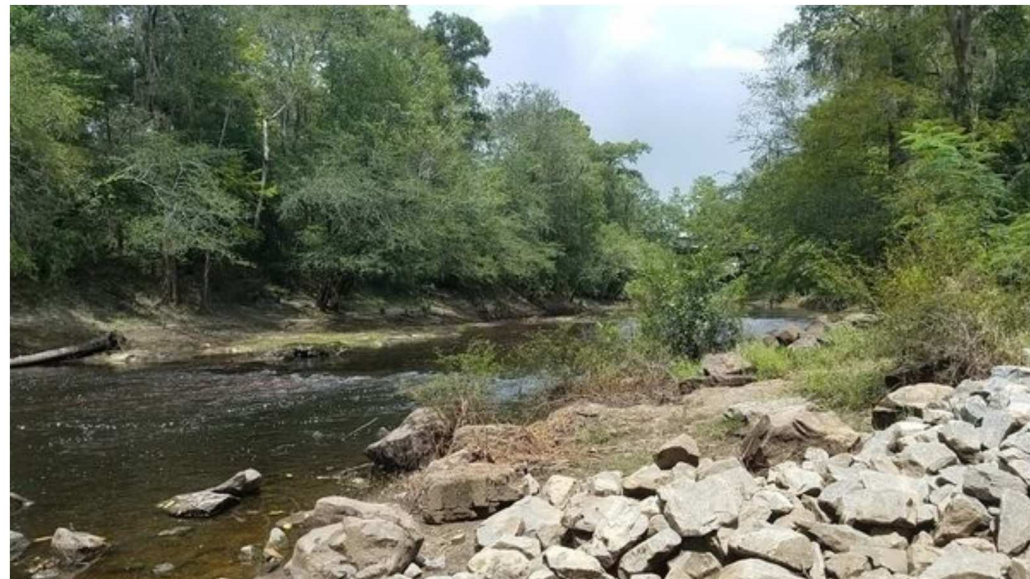
looking upstream from Troupville Boat Ramp to Troup Bridge.