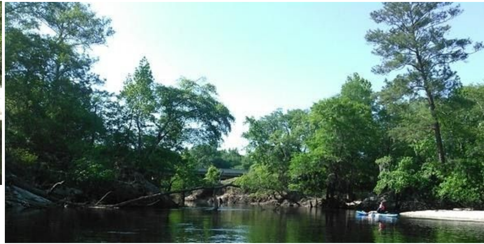
Naylor Beach, US 84 Bridge, 2016-05-07