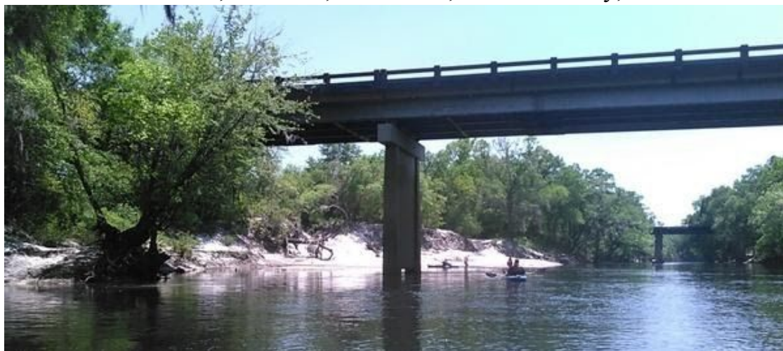
Howell Road Bridge and Mayday Landing, 2016-05-07

11.25 miles, 5.5 hours: left bank, Mayday Landing @ Howell Road , 749 Howell Road, Stockton, GA 31649, Echols County, GA.