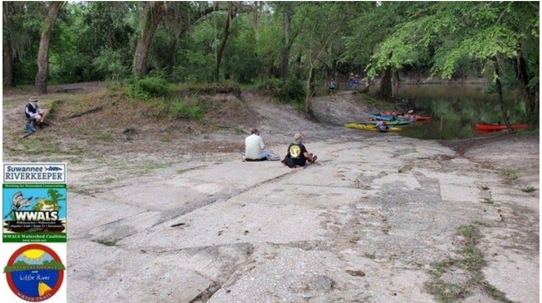
Knights Ferry Boat Ramp, June 16, 2019

Hahira, Georgia, March 4, 2020 — Celebrate the fiftieth Earth Day by helping clean up Knights Ferry Boat Ramp, Saturday morning, April 18, 2020. Afterwards, those who want to can paddle with us down the Withlacoochee River to Nankin Boat Ramp, cleaning up on the water and when we get to Nankin. This event is the first ever sponsored by WWALS, Georgia Power, the City of Valdosta, and Brooks County, Georgia.