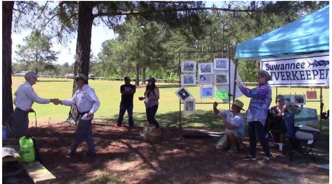
of awards last year