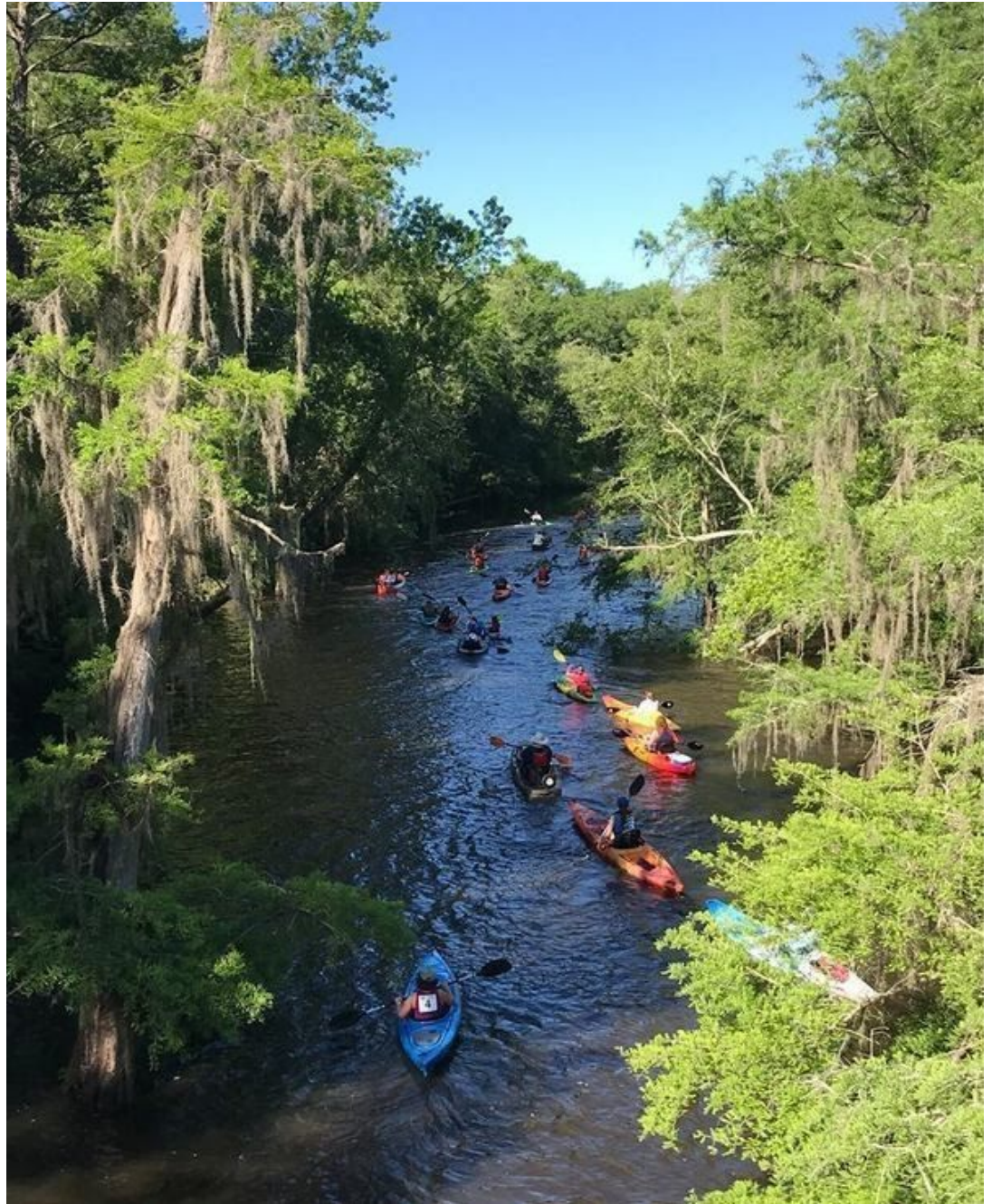
of the 2019 race start.