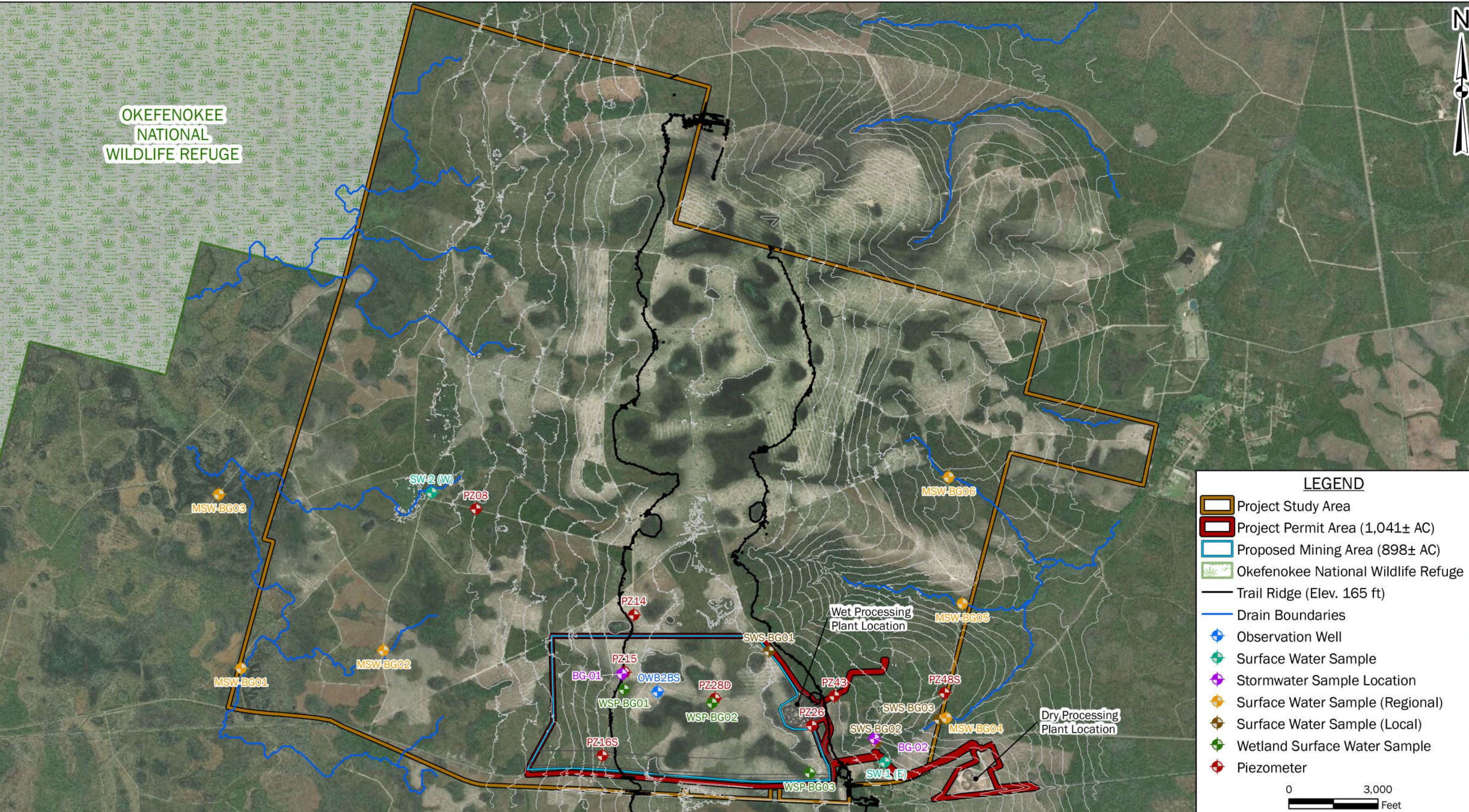
FIGURE 18: SURFACE WATER & BACKGROUND WATER-QUALITY MONITORING LOCATIONS TWIN PINES MINERALS ST. GEORGE, CHARLTON COUNTY, GEORGIA, 3/24/2018 (0.46 m Resolution) DRAWN BY: DEK CHECKED BY: SGR DRAWING DATE: 6/18/2020 REVISION DATE: N/A TTL JOB NO.: 000180200804.00 APPROX. SCALE: 1 in = 3,000 ft