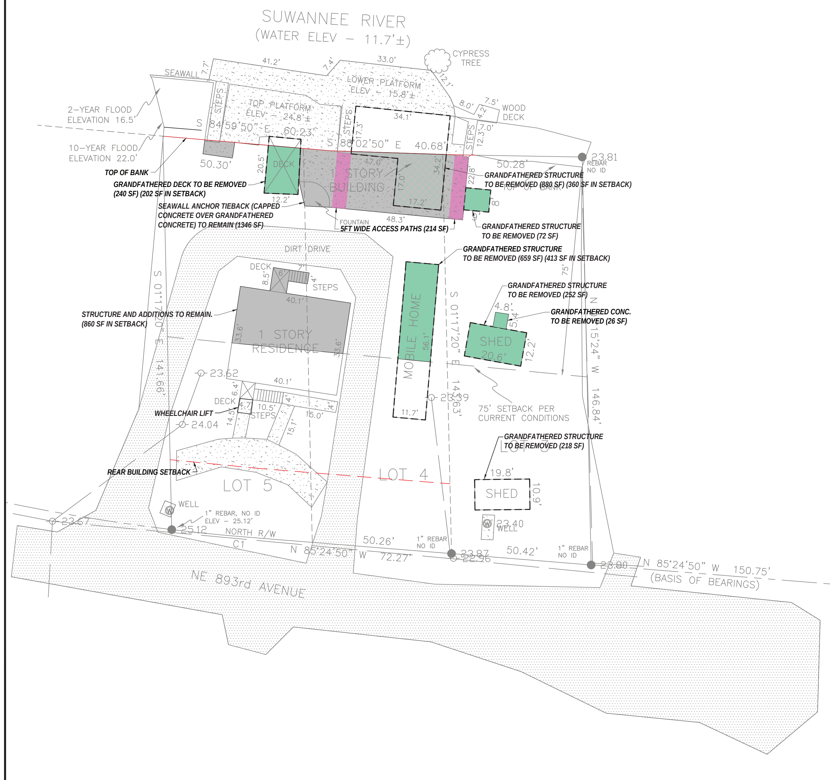
OVERALL SITE PLAN

NON-GRAND-FATHERED AREAS IN 75 FT SETBACK TO REMAIN: CONCRETE SEAWALL ANCHOR TIEBACK = 1346 SF STRUCTURES = 861 SF GRAND-FATHERED AREAS IN 75 FT SETBACK TO BE REMOVED: CONCRETE = 26 SF STRUCTURES = 1300 SF EXEMPT AREAS: 5 FT WIDE ACCESS PATH TO STAIRS = 214 SF TOTAL UNMITIGATED AREA IN 75 FT SETBACK = 667 SF