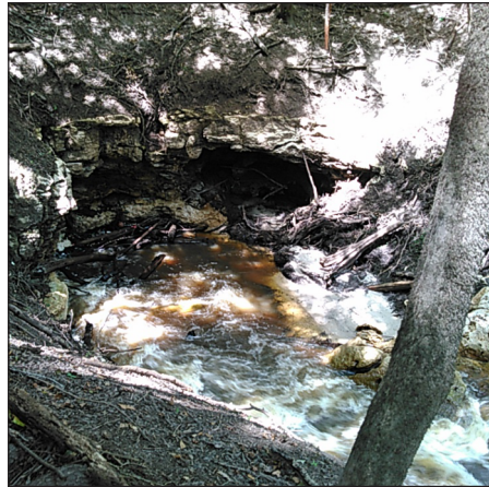
The Siphon, Dead River, Hamilton County, FL