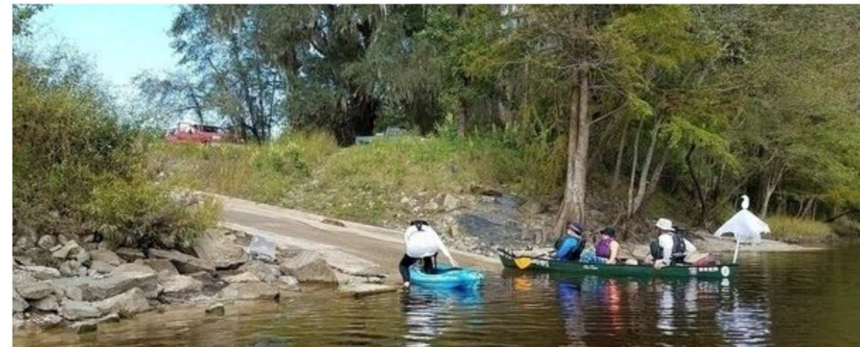
State Line Ramp, 2017-10-14