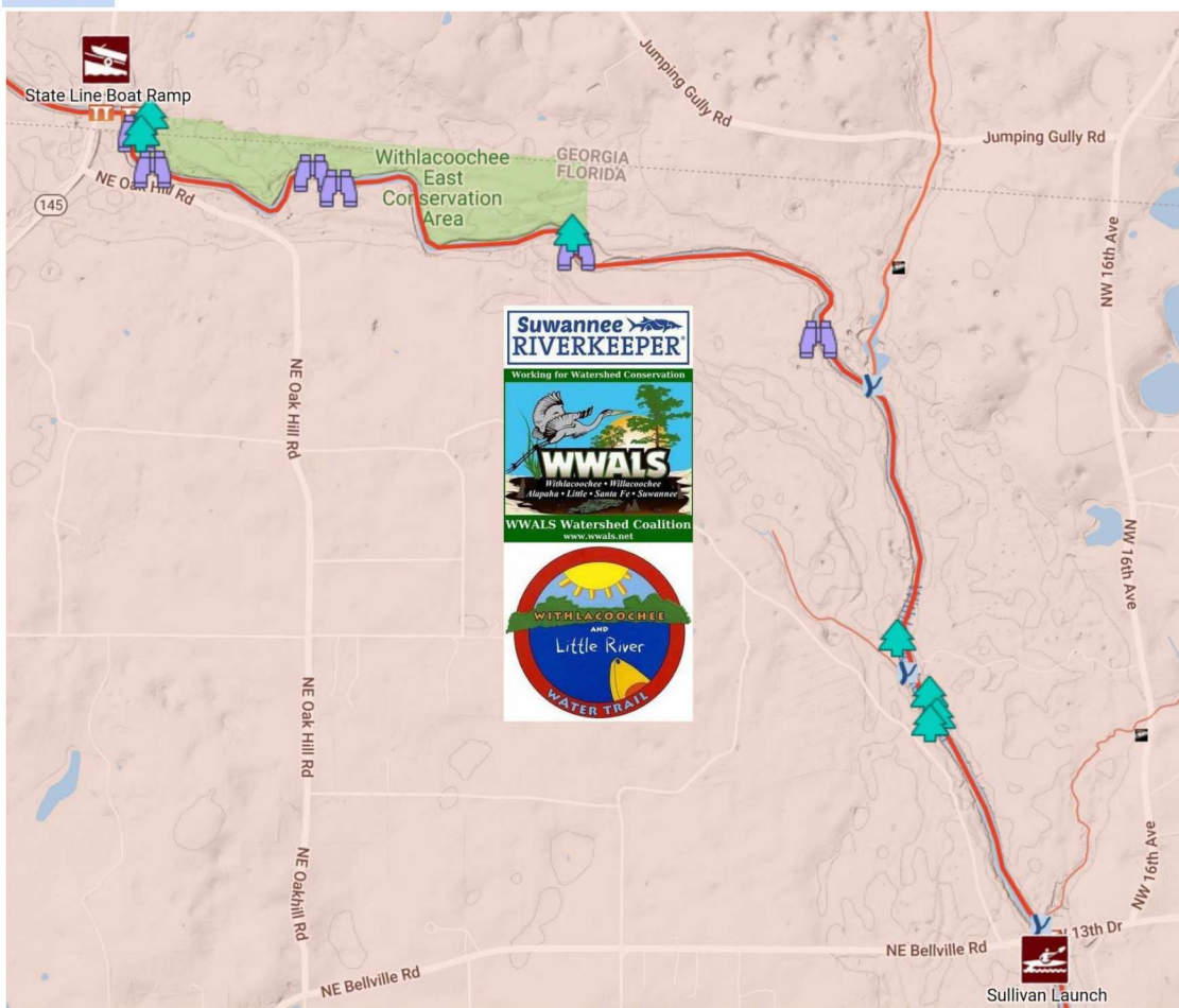
Map background ©2019 Google; Maps by WWALS.