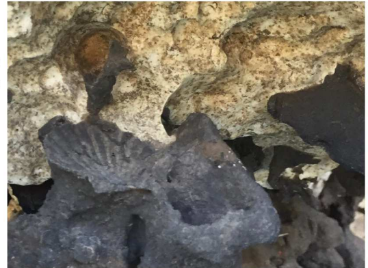
Mollusk shell imprint in karst formation along Withlacoochee River

Limestone underlies much of the WWALS watersheds and is visible as karst banks along many of the region's rivers. This rock is formed from skeletal fragments and waste products of ancient marine organisms, such as corals and mollusks, that accumulated over eons at the bottom of the shallow seas that covered much of the area for millennia. Pressure converted this debris to stone, comprised largely of calcium carbonate. Acidic water has dissolved channels in this soft stone, creating the incredible, Swiss cheese embankments along the lower Alapaha, Withlacoochee and middle Suwannee Rivers.