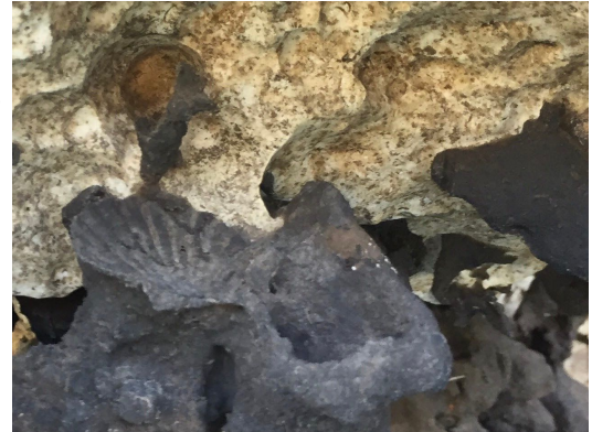
Mollusk shell imprint in karst formation along Withlacoochee River

Limestone underlies much of the WWALS watersheds and is visible as karst banks along many of the region's rivers. This rock is formed from skeletal fragments and waste products of ancient marine organisms, such as corals and mollusks, that accumulated over eons at the bottom of the shallow seas that covered much of the area for millennia. Pressure converted this debris to stone, comprised largely of calcium carbonate. Acidic water has dissolved channels in this soft stone, creating the incredible, Swiss cheese embankments along the lower Alapaha, Withlacoochee and middle Suwannee Rivers.