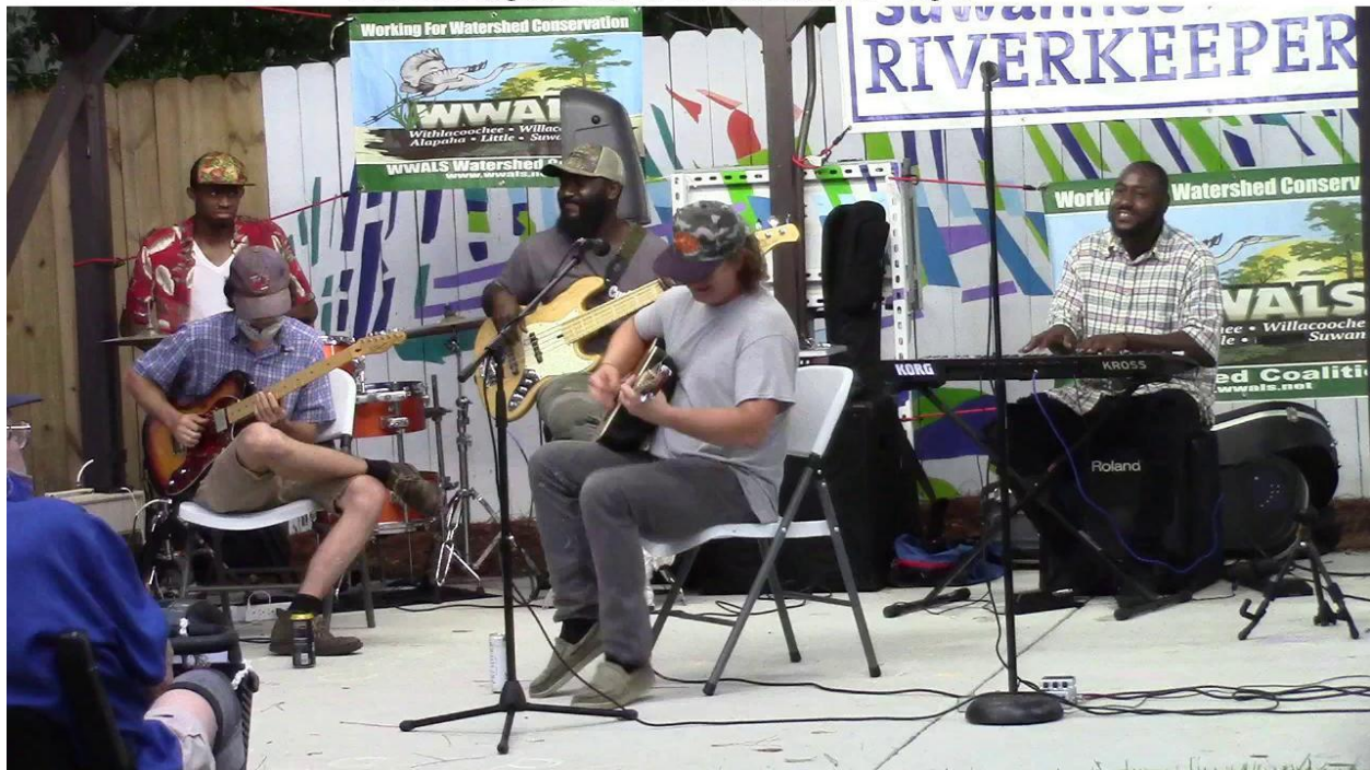
of Dirty Bird and the Flu, Headliners at the 2020 Suwannee Riverkeeper Songwriting Contest.

Finals: August 21, 2021, Valdosta, Georgia