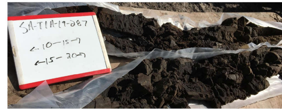
PHOTOGRAPH 3. UNCONSOLIDATED BLACK SAND

AS SHOWN ABOVE, CONSOLIDATED SANDS ARE EASILY RECOGNIZED IN THE FIELD BASED ON THE FOLLOWING CHARACTERISTICS: