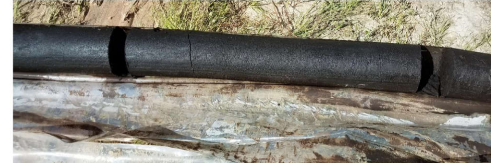
PHOTOGRAPH 1. LOW PERMEABILITY HUMATE-CEMENTED CONSOLIDATED BLACK SAND

THE CONSOLIDATED BLACK SANDS ARE EASILY DISTINGUISHED FROM THE HIGHER PERMEABILITY UNCONSOLIDATED AND SEMI-CONSOLIDATED BLACK SAND LAYERS DUE TO THE FIRM OR STIFF, CEMENTED CHARACTERISTICS OF THE SAND GRAINS (SEE PHOTOGRAPH 1). RESULTS OF LABORATORY PERMEABILITY TESTING OF HUMATE-CEMENTED CONSOLIDATED BLACK SANDS COLLECTED FROM THE SITE INDICATED VERTICAL HYDRAULIC CONDUCTIVITIES RANGING FROM 10 -7 TO 10 -8 CENTIMETERS PER SECOND (CM/S). DIFFERENCES IN THE APPEARANCE OF THE CONSOLIDATED, SEMI-CONSOLIDATED AND UNCONSOLIDATED BLACK SANDS ARE SHOWN IN THE PHOTOGRAPHS PROVIDED BELOW: