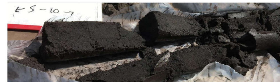
PHOTOGRAPH 2. SEMI-CONSOLIDATED BLACK SAND