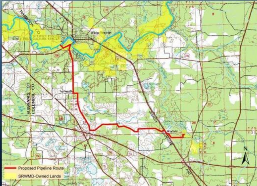
Project Location and Potential Pipeline Alignment

Four years later, SRWMD added a plan for another such pipe, from Branford. https://wwals.net/?p=55981