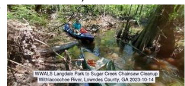
WWALS Langdale Park to Sugar Creek Chainsaw Cleanup Withlacoochee River, Lowndes County, GA 2023-10-14