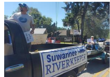
Hahira Honeybee Festival 2022

Check out Outings and Events for more details. https://wwals.net/outings/