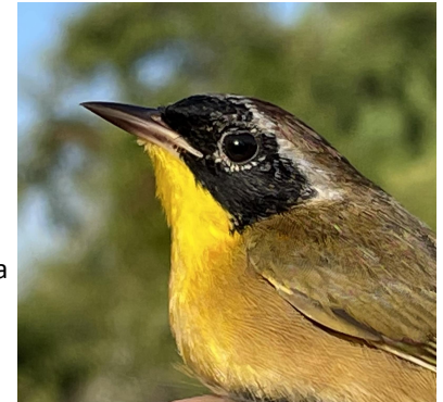
Common yellowthroat

As you head out on the waterways this month, be on the lookout for all the beautiful yellow natives. —Bret Wagenhorst