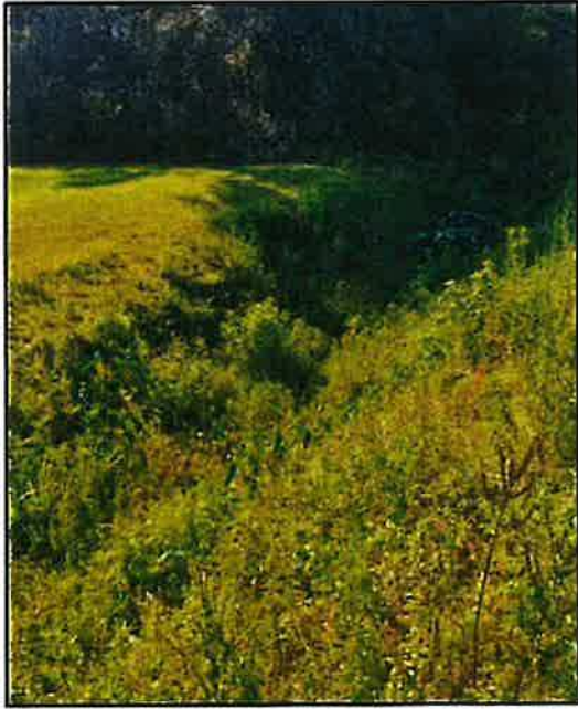
Photograph 8: Lower reach of D-1.