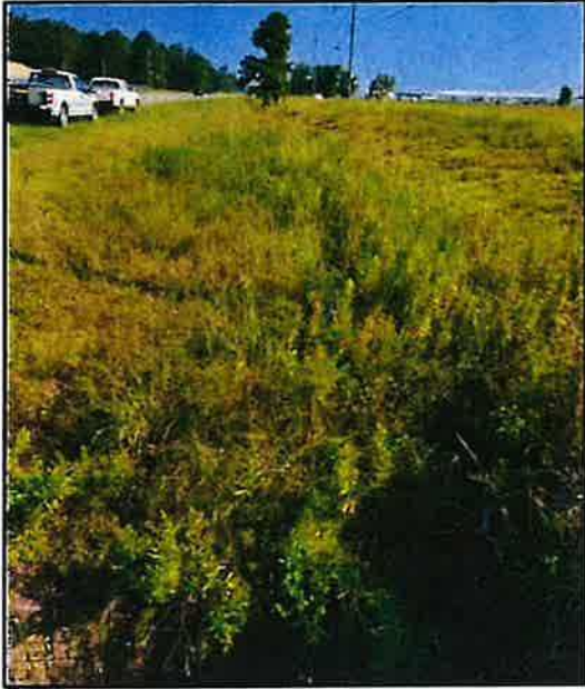
Photograph 5: Lower reach of D-1.

State Buffer Variance Application — COV Old Clyattville Road Widening — TTL Project No. 21-07-00563.01 Valdosta, Lowndes County, Georgia Photos taken June 30, 2023