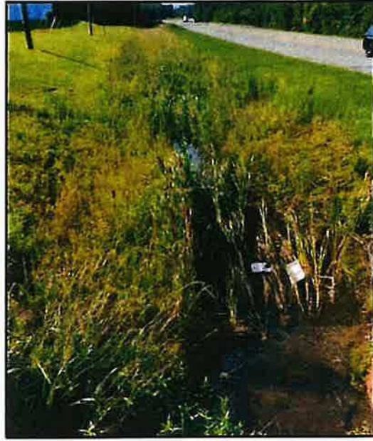
Photograph 6: Lower reach of D-1.