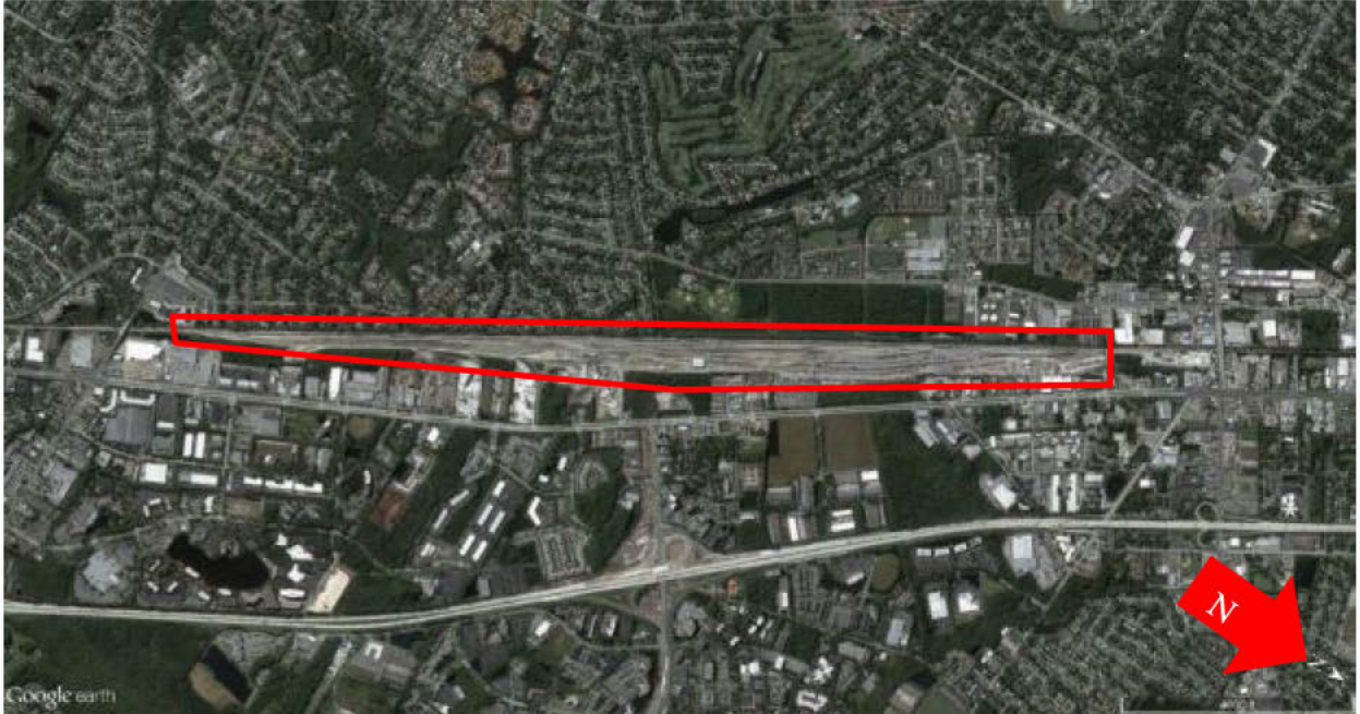
Figure 16. Aerial image of the FECR Bowden Rail Yard (enclosed in red outline). North is to the lower right in the image. The FECR intermodal facility is located to the north (right) of the yard.