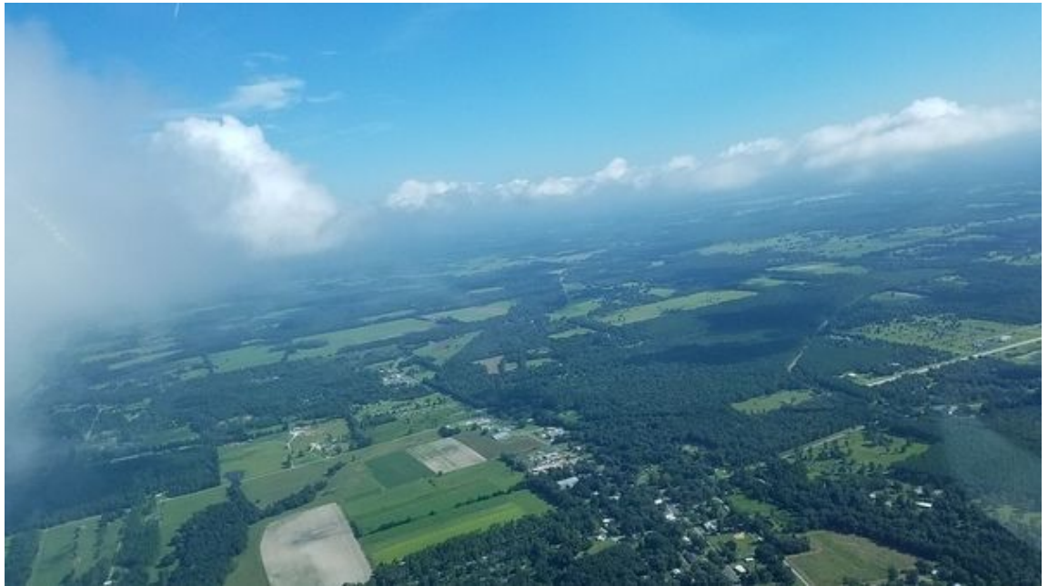
NNE Across Worthington Springs to Pritchett mine site, 10:25:40, 29.9189039, -82.4310161

Worthington Springs is downhill from the Pritchett mine site, and downriver from all the mine sites.