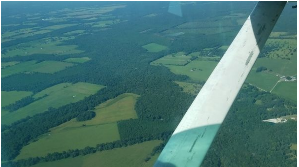
SW down New River to Beasley mine site in upper right, 10:03:25, 29.9813090, -82.2832920

Farther east, the Beasley mine site drains into the New River, which the mine proponents do not own.