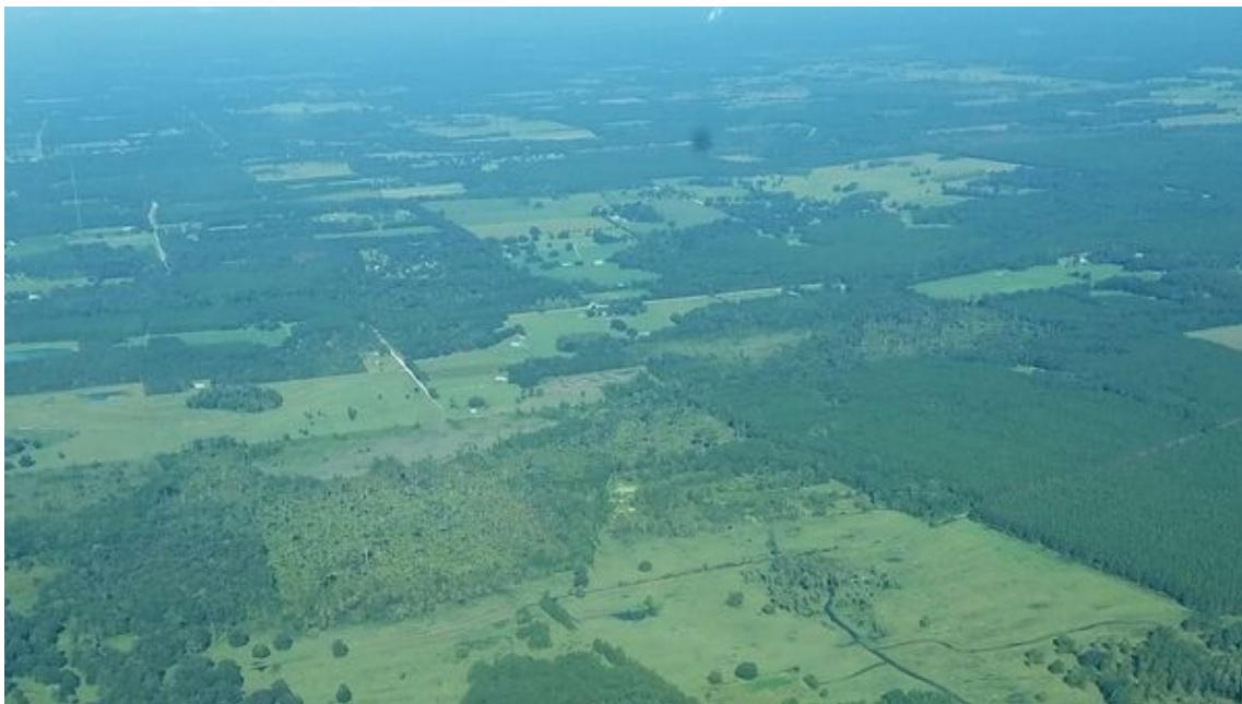
W across Howard mine site, Five Mile Creek, SW 48th Path, CR 18A, Pritchett mine site, Worthington Springs, 09:53:54, 29.9461300, -82.3565700

The Howard mine site at the corner of CR 231 and the New River includes Five Mile Creek and other wetlands. Between there and the Pritchett mine site many people own land that could be affected. Just beyond is Worthington Springs, downhill and thus downstream from the mine.