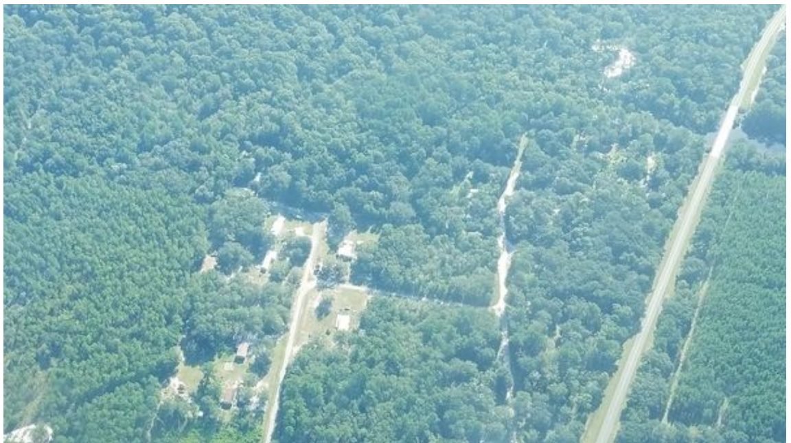
E down SE 54th St, CR 231 New River bridge, Howard mine site on right, 09:54:45, 29.9537460, -82.3515830

People live on CR 231 at the New River, sandwiched between the New River Properties mine site upriver and the Howard mine site right across the road.