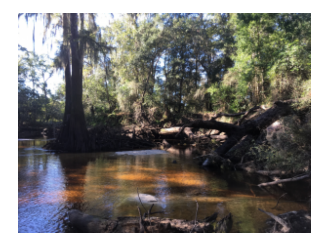
Upload Ecological Value Document (5):

10. Do you have an existing plan or budget to maintain and manage this property after the project is complete? (15 points)