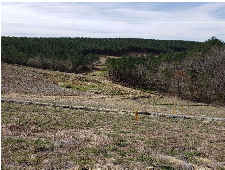
Photo 4: Rock Springs Loop. Overview of restored right-of-way near the WCW9C015 wetland and slide area on 3/7/2020. Facing southwest.