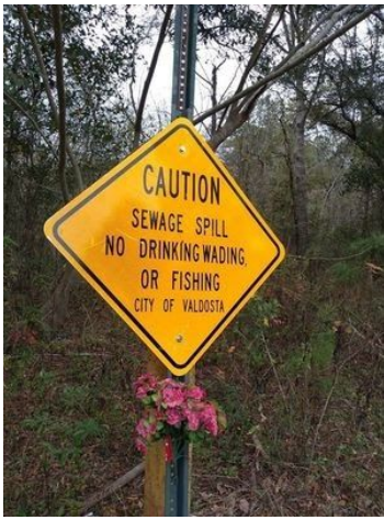
Caution sign at Troupville Boat Ramp, 2019-12-21. Someone decorated it with flowers, like a cross at a highway wreck site.