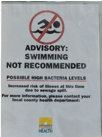
Advisory at Madison Blue Spring, 2019-12-16