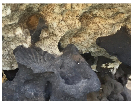
Mollusk shell imprint in karst formation along Withlacoochee River

Limestone underlies much of the WWALS watersheds and is visible as karst banks along many of the region's rivers. This rock is formed from skeletal fragments and waste products of ancient marine organisms, such as corals and mollusks, that accumulated over eons at the bottom of the shallow seas that covered much of the area for millennia. Pressure converted this debris to stone, comprised largely of calcium carbonate. Acidic water has dissolved channels in this soft stone, creating the incredible, Swiss cheese embankments along the lower Alapaha, Withlacoochee and middle Suwannee Rivers.