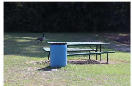
Picnic table in Payton Park in disrepair