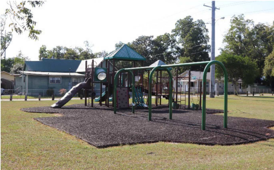
Seating with shade could be added to areas surrounding amenities such as this playground in Greer Park to enhance user experience. Seating could be movable to allow users to customize their seating experience and colorful to add vibrancy to the park.