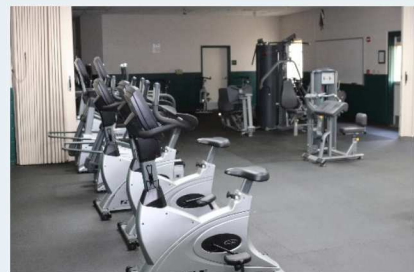
Interior finishes, furniture, and equipment in Jaycee Shack Park and Mildred Hunter Community Center that are in good condition