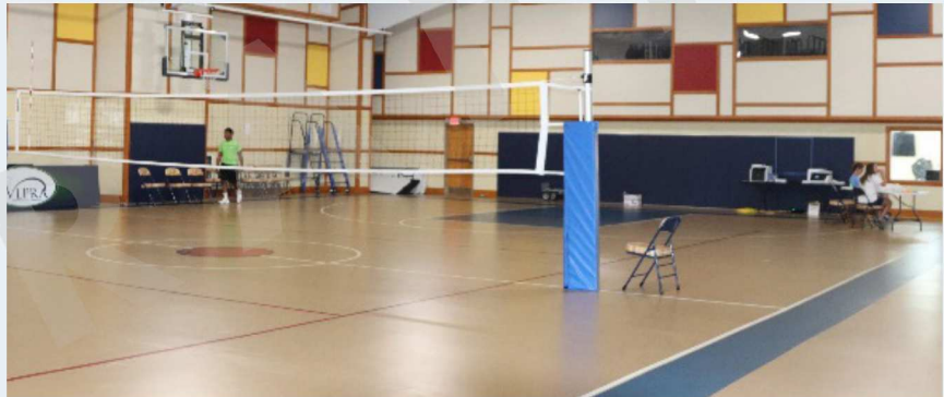
Well-organized and efficient interior layouts with functioning dimensions at Forrest Street Administration Center and Jaycee Shack Park