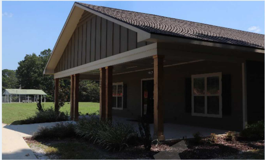
Riley-Ledford Park’s attractive architectural character and scale contributes to the overall appearance and positive first impression of the park and surrounding area