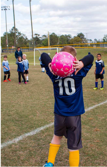
Vallotton Youth Complex