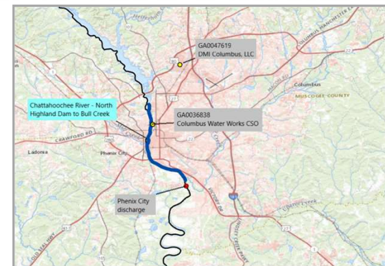
North Highland Dam to Bull Creek