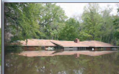
Above left, flooding near Everett City, Georgia. Above right, flooding in Lowndes County Georgia.